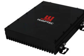
Only for reference